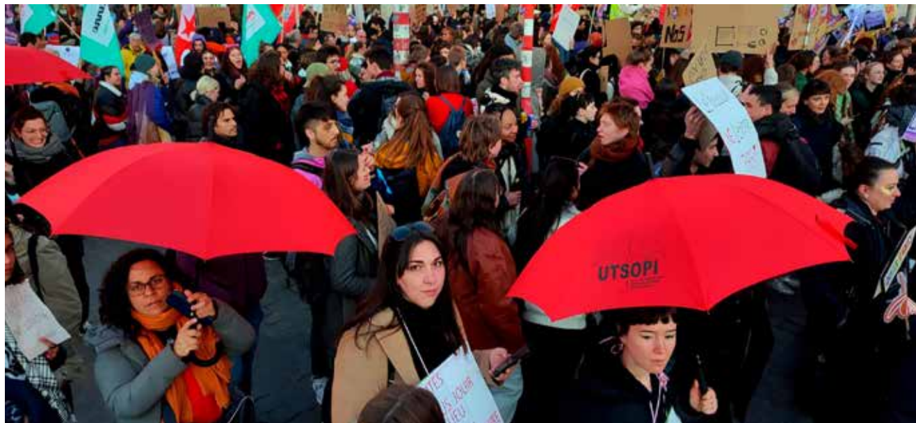
↳ Demonstration in Brussels by UTSOPI, one of the Belgian organisations representing sex workers.

sector which is not recognised by the state, because the existence itself of the sector is against the law.’ Despite this, he notes that, in Belgium, unions played an essential role in the process of drafting the new laws and supporting sex worker organisations throughout the process.